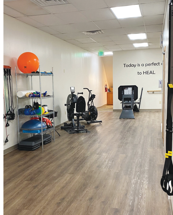
Winneshiek Medical Center Rehabilitation & Sports Medicine clinic in Cresco, IA