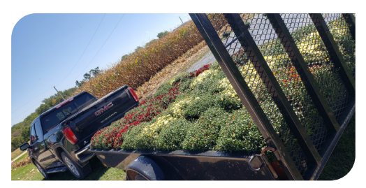
Thank you to all the Auxilians (and husbands!) who helped pick up all the mums